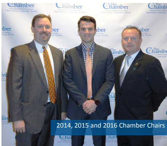
2014, 2015 and 2016 Chamber Chairs