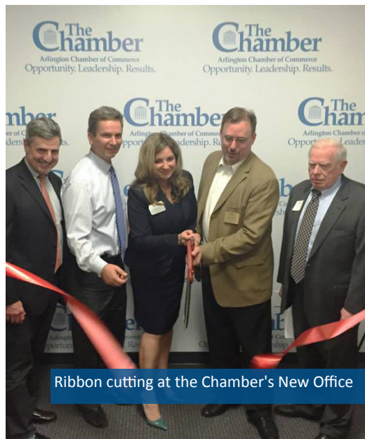
Ribbon cutting at the Chamber's New Office

Rocklands Barbeque and Grilling Company Ruth's Chris Steakhouse Sangam International Catering Windows Catering