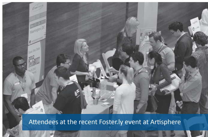
Attendees at the recent Foster.ly event at Artisphere