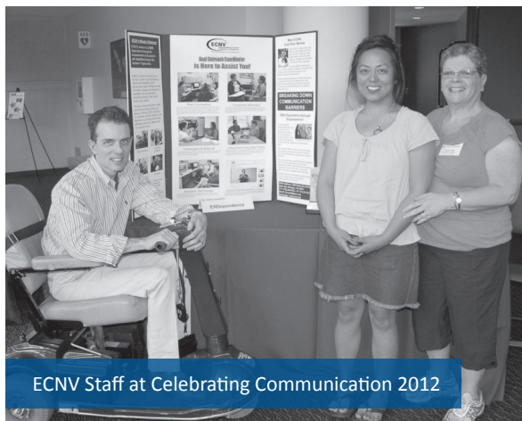
ECNV Staff at Celebrating Communication 2012

ECNV is a Center for Independent Living (CIL) serving people with disabilities in the counties of Arlington, Fairfax and Loudoun, and the cities of Alexandria, Fairfax and Falls Church. Our main office is in Arlington County with a satellite office in Loudoun County. We promote a more accessible and inclusive community through advocacy, educational programs, technical assistance and more to individuals, businesses and government. Partnering and working together with the community to ensure that our community is a community for all!