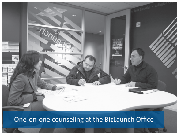
One-on-one counseling at the BizLaunch Office

Whereas traditional business attraction and retention efforts have dedicated considerable resources to attracting large companies, with fewer deals in the market for jurisdictions to vie over, today's successful economic development strategies must look increasingly to homegrown opportunities. A significant part of growth in the new economy will come from promising entrepreneurs and start-ups in the high-growth service and technology-based industries. Only by supporting entrepreneurship in our own community can AED help sustain Arlington's diversified economy and create new jobs.