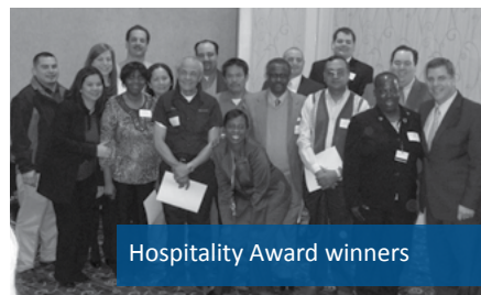
Hospitality Award winners

The Hospitality Awards honor those people who go above and beyond what's written in their job description to make you feel welcome and comfortable. Hospitality management from businesses throughout Arlington nominated the best of their staff to receive Hospitality Superstar awards, in addition to the Legendary Service Award for those who have completed 25 or more years of service.